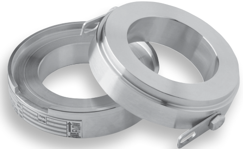
FDZ Series disk mounts into UHZ Series disk holder (refer to UHZ Series data sheet)