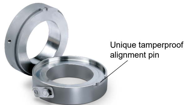
RLP Series disk mounts into RLP-I Series disk holder