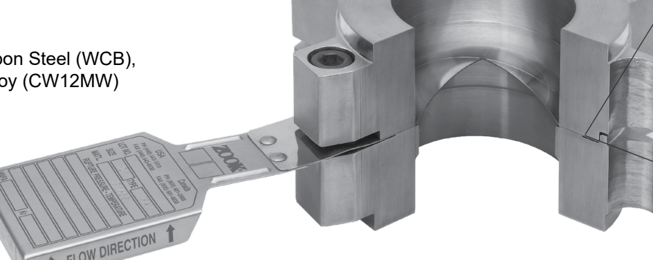
FAH "Pre-Torque" Holder